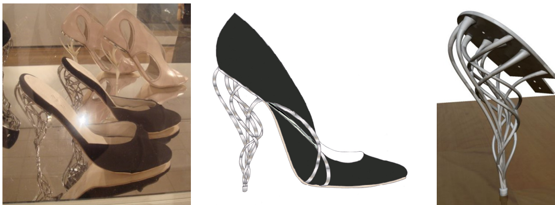
Figure 2. Rapid prototyping model of the heel, final shoe and sketch above

The outcome, see Figure 2, is that the first design prototypes have been successfully made into shoes and exhibited in the student degree show. As a result the shoes have been shortlisted for two design awards and the technology suppliers have an interesting case study which demonstrates the potential for this material process in new markets, and useful marketing prototypes which can be used for trade shows and promotional materials. The heel displayed in Figure 2 is not just a test piece for this the rapid prototyping technology, it is also a fashionable item, which keys in with current cat walk fashion for interesting shapes in heels. The shapes are organic and flowing. The design of these heels is interesting as an art object, just as much as an example of a new technology. During the design process observers reacted to the visual quality of this organic and praised the emerging design for its aesthetic qualities. In this sense the design was a success even before its structural qualities were tested. The playful nature of the design process and aesthetic considerations were the drivers without constraints of cost or mechanics. However, the actual cost which would be around $2000 is still acceptable in the couture market, so that the product is potentially viable, and alternative materials are also now being tested which would reduce costs and make larger volume production possible