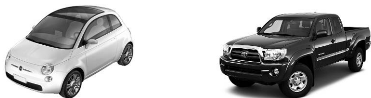
Figure 1. (left) New Fiat 500. (right) Toyota 4WD

What's the first thing that crosses your mind when you look at the cars in the picture below (figure 1)? Maybe you will recognise the old forms of the 'Fiat 500' or the cute, cosy and a little bit endearing design of the car. The other car looks very powerful and maybe you can imagine yourself driving around in a rough scenery? All everyday products evoke associations like these cars do. These associations are generated due to our social cultural background or the history of experience and knowledge we have gathered in our lives. We've learned that red means stop or danger and we can recognize the characteristic forms of the old Fiat 500 in the new one. These associations will lead to an emotional feeling or experience and will also help us to form our own view on the product [1].