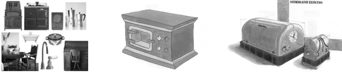
Figure 3. (left) Mood board historic style. (centre) Microwave oven in historic style designed on regeneration level. (right) Microwave oven in historic style designed on transformation level.