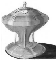
Figure 5. "The Godfather" DVD player

Students need to find a metaphor that will stand for the general idea of the movie by analysing it. One student chose the movie "The Godfather", a crime drama about a mafia family dynasty. The movie focuses on 'power', 'family' and 'family heirloom'. The final design of the DVD player (figure 6) is created by using all four translation levels. The first and second level are reached by designing an object that would fit the stage properties of the film. The third level is reached by designing a somewhat mysterious object with a hidden interface. The closure of the DVD player is not directly visible. The last step is reached by creating a cup that symbolizes power and victory and could be a family heirloom which is passed from one generation to the next. By this means the DVD player represents a metaphor of the general idea of the movie.