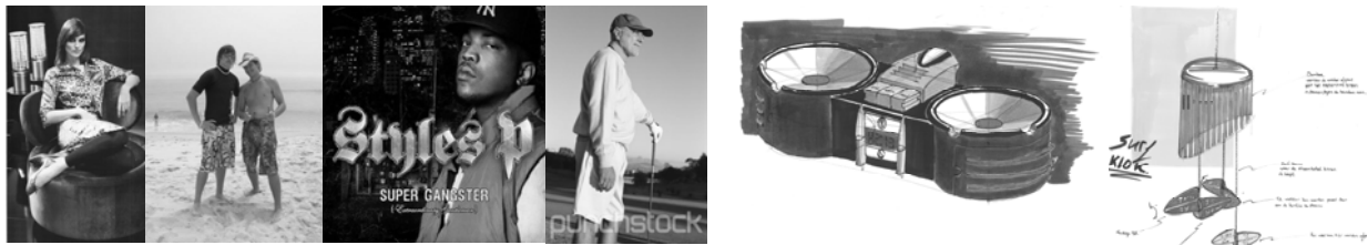
Figure 4. (left) Style types. (centre) Alarm clock for the rapper. (right) Alarm clock for the surfer.

The second level of the design tool is going beyond merely copying style elements from the mood board towards creating new forms that match the mood board on a different level. For this the students need a deeper understanding of the language of forms. One of the students created a new shape for the microwave oven, which refers to historic bread boxes (figure 4, right). The design fits the historic style. It evokes associations with historic products instead of simply copying style elements. The “input”, which was the mood board, has therefore been used in the design by “transforming” it into something new.