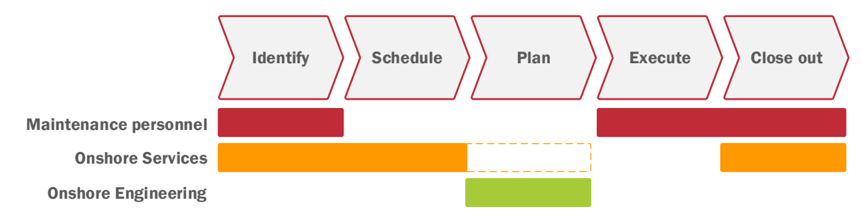
Figure 4: The maintenance process stages utilized at the case company. The planning stage is not a part of the Onshore Services scope, but they are often required to help Onshore Engineering in this stage.

The case study described in this section was used to further investigate the possible benefits of employing the suggested concurrent engineering initiatives in maintenance management. The study was conducted in a company that operates offshore oil and gas platforms with a focus on the expensive offshore maintenance operations. As some of the maintenance requires an extra rig to be transported to the field, the schedule is required to be created up to two years in advance. This means that scheduling is performed before planning, switching around the scheduling and planning stages compared to the structure identified in literature. The maintenance process stages are shown in figure 4.