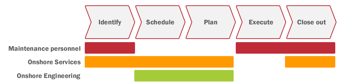
Figure 5: The suggested maintenance management process. Onshore Engineering and Onshore Services cooperate to ensure optimal scheduling and planning.

The identified solution aligns the process, ensuring that connected decisions are being made at the same time and that these decisions are all made with the right people present. This is achieved by having both Onshore Services and Onshore Engineering present in scheduling and planning. By mapping out the process, it is possible to determine what decisions are being made at what stage and what data is required for it. Having a clear focus in each of the individual stages shortens them and makes it easier to ensure that the right knowledge is available at the start of a stage.